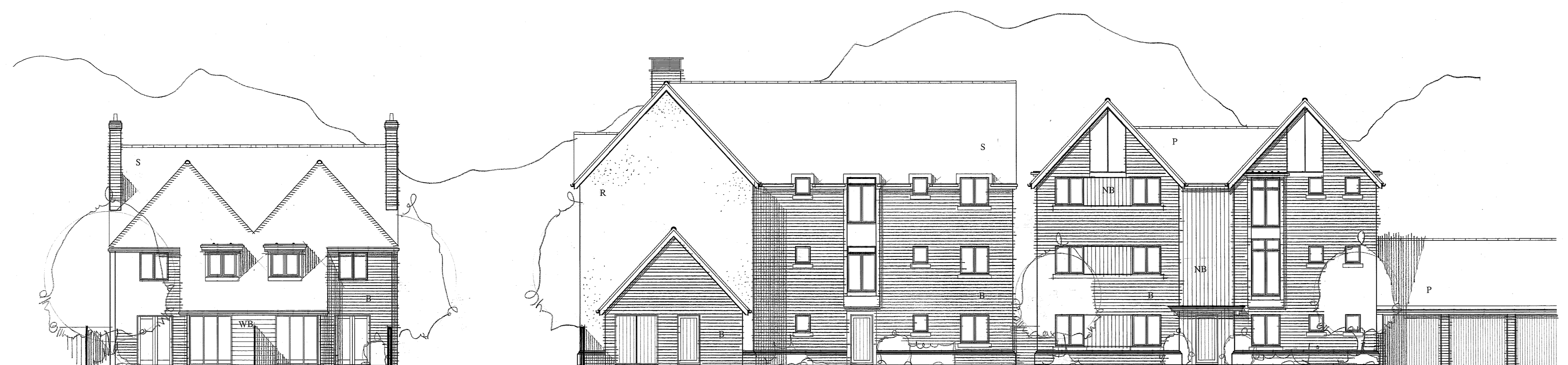
45 44 Units 44-45 Rear Elevation