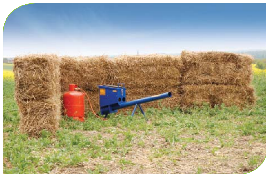
Auditory scarer with baffles

Some scarers and deterrents combine sound and visual stimuli.