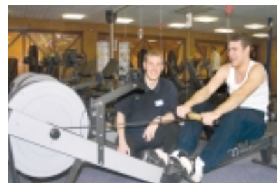
Kingfisher Leisure Centre, Sudbury